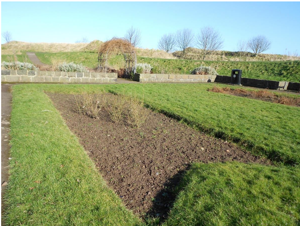
Photo 1 Largely empty rose bed in rose garden