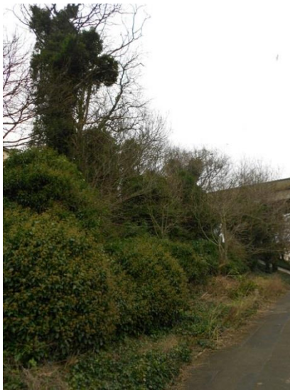
Photo 1 Weed growth by New Road