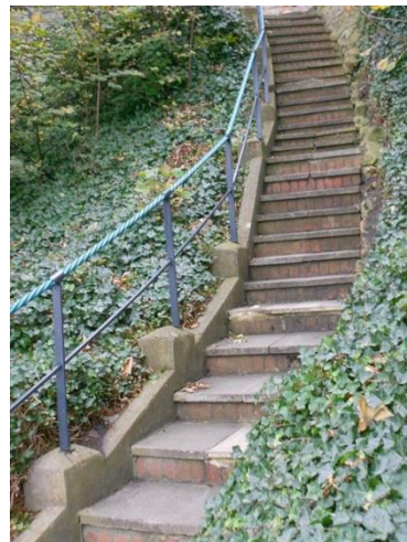
Photo 4 Style of replacement handrail