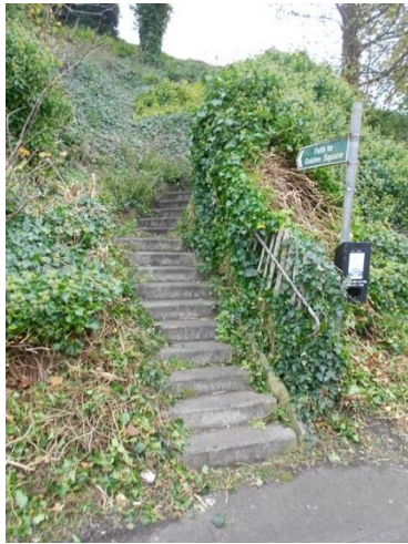
Braes [Photo 4].