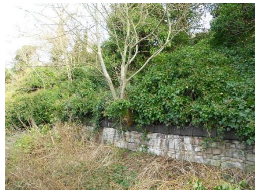
Photo 6 Tree growing on wall top