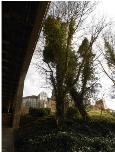
Photo 5 Tree too close to bridge