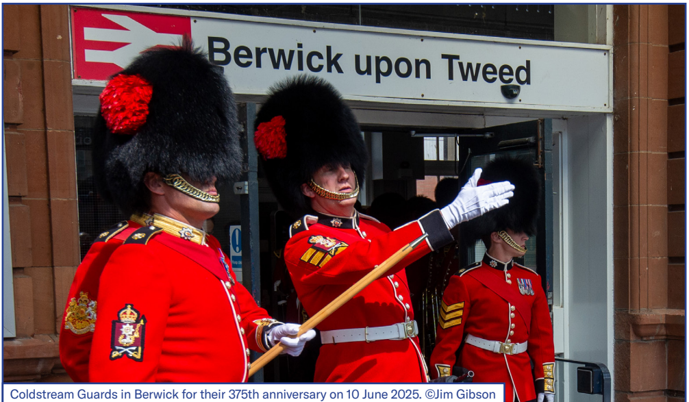
Coldstream Guards in Berwick for their 375th anniversary on 10 June 2025.

If you'd like to contribute an article or advertise in a future edition, please contact info@berwick-tc.gov.uk .